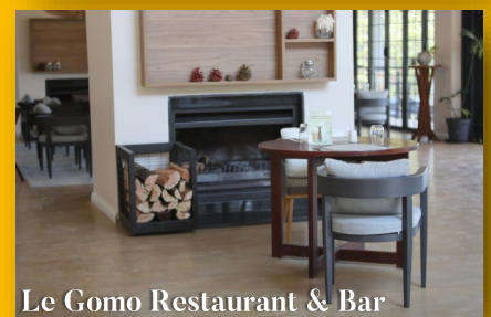
Le Gomo Restaurant & Bar