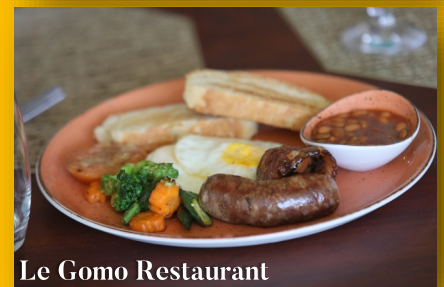
Le Gomo Restaurant