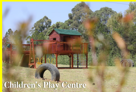
Children's Play Centre