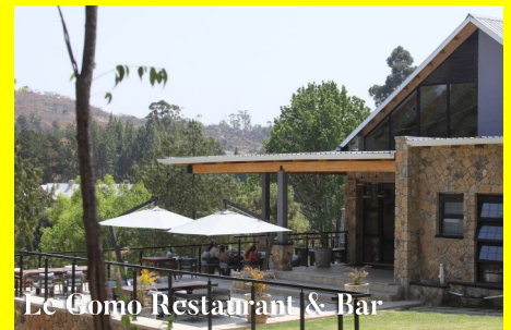
Le Como Restaurant & Bar