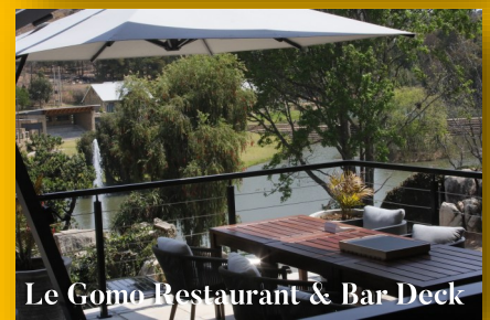
Le Gomo Restaurant & Bar Deck